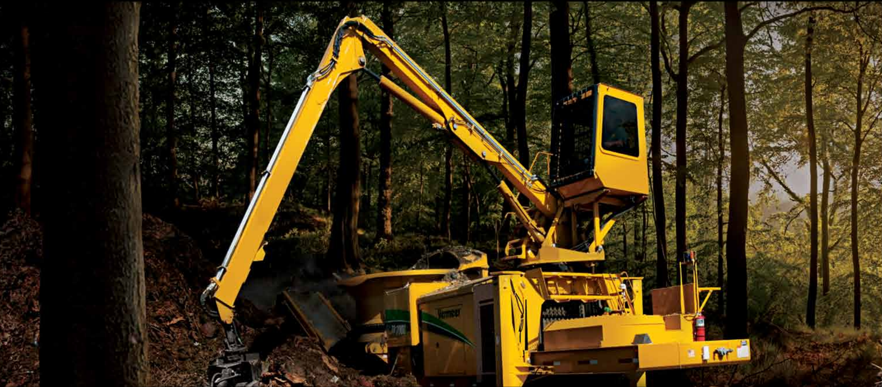
1: Non-Bridging Tub Design. Allows for cutters to pass along tub wall while mill length passes the center point of the tub to reduce bridging of material and increased production. Patented Thrown Object Restraint System (TORS) reduces distance of thrown objects allowing for tighter work areas, and also helps to improve flow of material into mill.