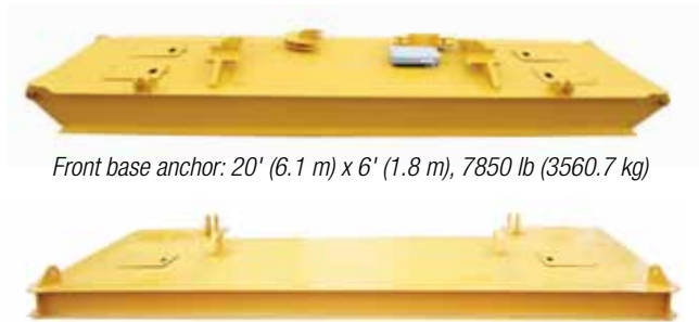
Front base anchor: 20' (6.1 m) x 6' (1.8 m), 7850 lb (3560.7 kg)