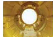
Replaceable die inserts