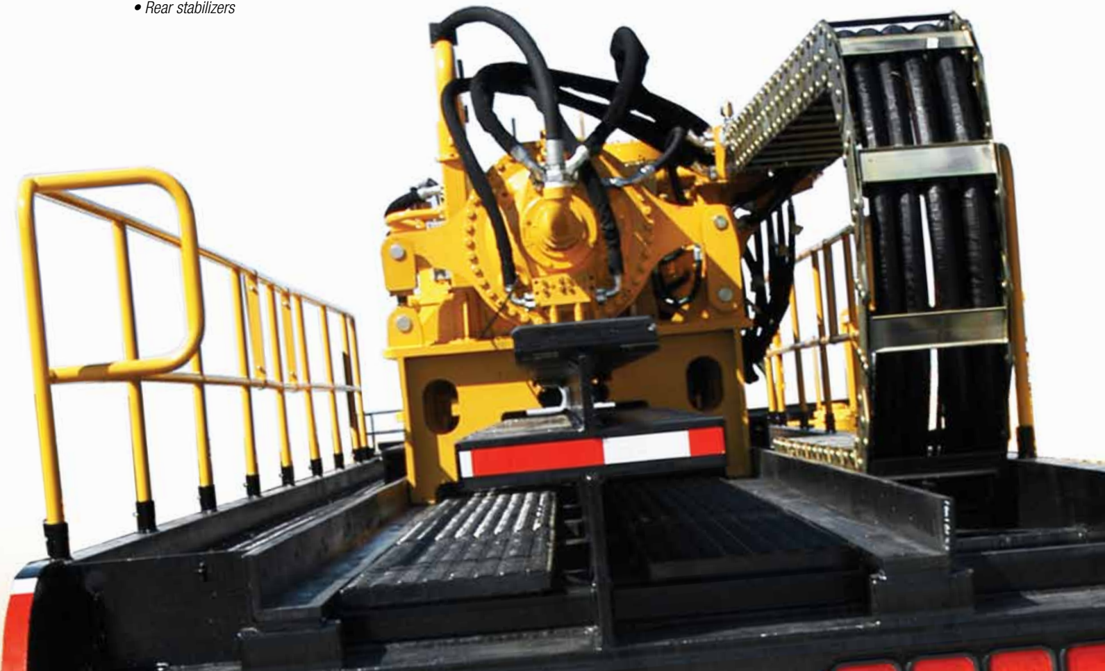
Rear base anchor: 16' (4.9 m) x 7.8' (2.4 m), 4300 lb (1950.4 kg)